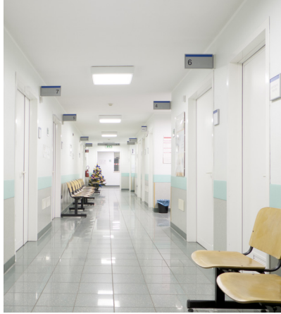
→ HEALTH CARE