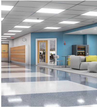
→ HIGHER EDUCATION FACILITIES