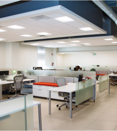
→ LARGE COMMERCIAL OFFICE SPACES